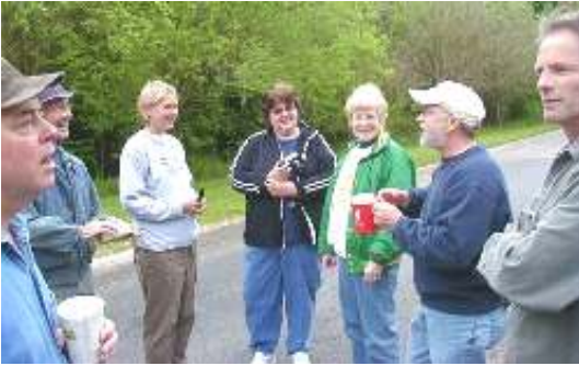
Getting ready .....