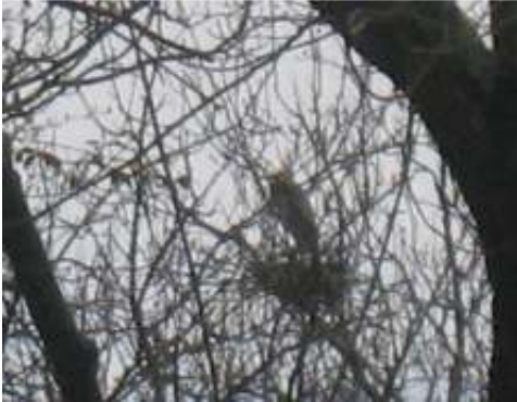
Blue Heron nesting

Several blue herons have taken up residence and are nesting in the woods along the creek east of the homes on the middle of Bent Tree Lane. One neighbor has reported seeing a whole flock flying together. Another neighbor noted that Blue Herons tend to nest in large groups. Many Bent Tree Laners are enjoying the sight of these magnificent birds.