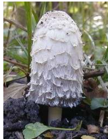
Shaggy Mane Fungus