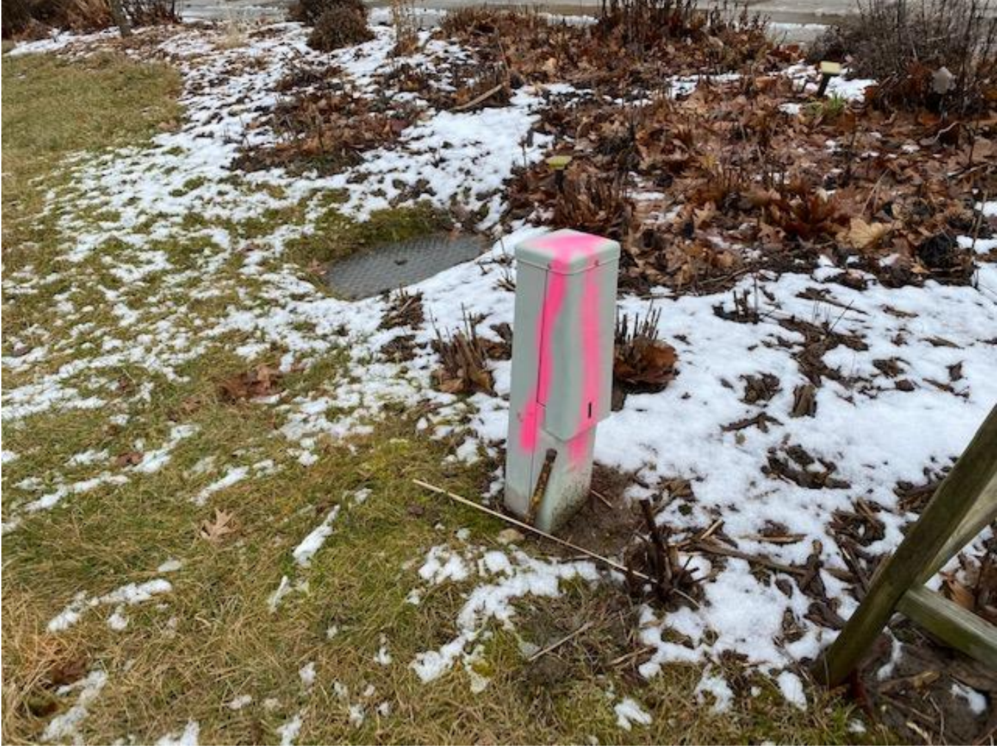
And why are they in my yard?

You may have noticed a number of utility boxes around the subdivision that have been marked with pink paint stripes. Some of you might remember years ago when we had Microwave Cable as a TV source. These boxes were used to run the cable along the roadways and into residents' homes. With the demise of Microwave Cable they no longer serve a purpose. USIC (this is the company that JULIE contracts with to do our markings) came out and identified all the boxes around Indian Creek (approximately 30) that are now defunct. The plan is to remove the boxes during an upcoming spring workday and take them to a recycling center. If you have any questions please contact me at <u>fwalk@frontiernet.net</u> or call 309-830-2188.